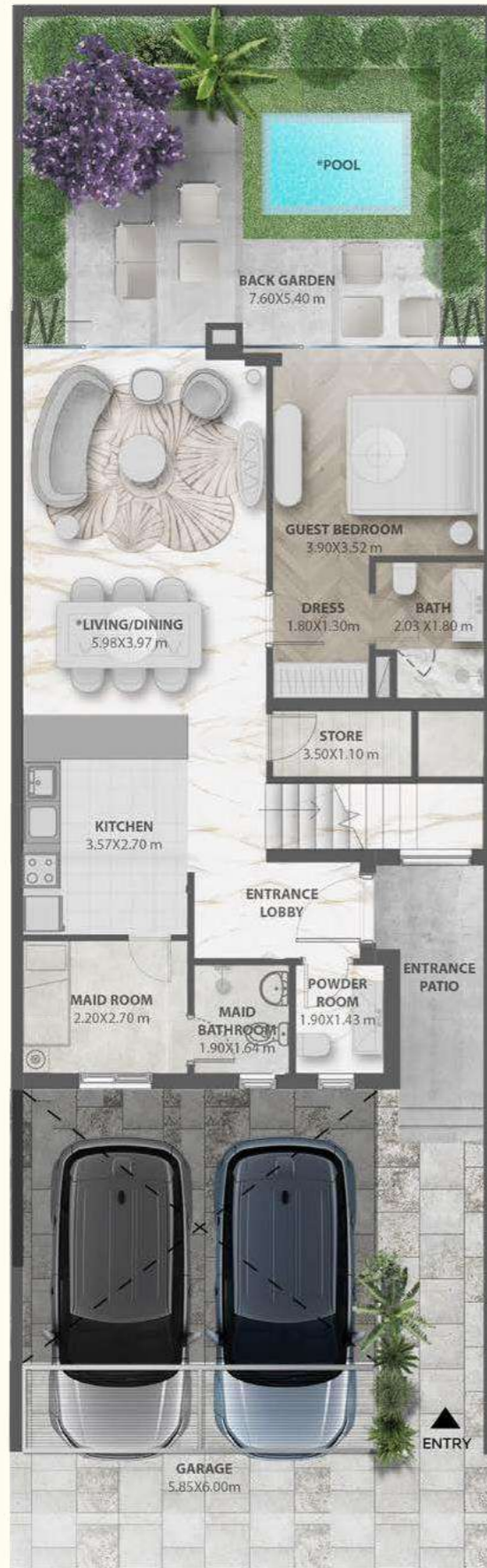
ÉLÉGANTE UNIT GROUND FLOOR PLAN *Pool is not included