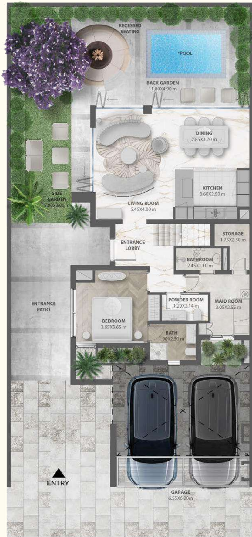
GRANDE UNIT GROUND FLOOR PLAN