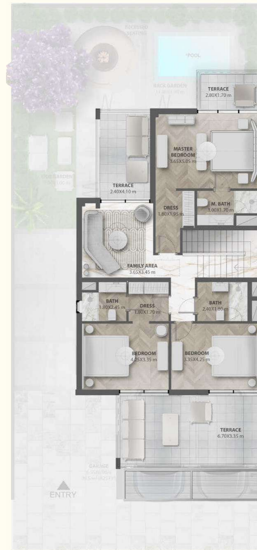
GRANDE UNIT FIRST FLOOR PLAN