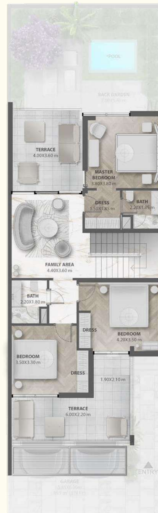
ÉLÉGANTE UNIT FIRST FLOOR PLAN